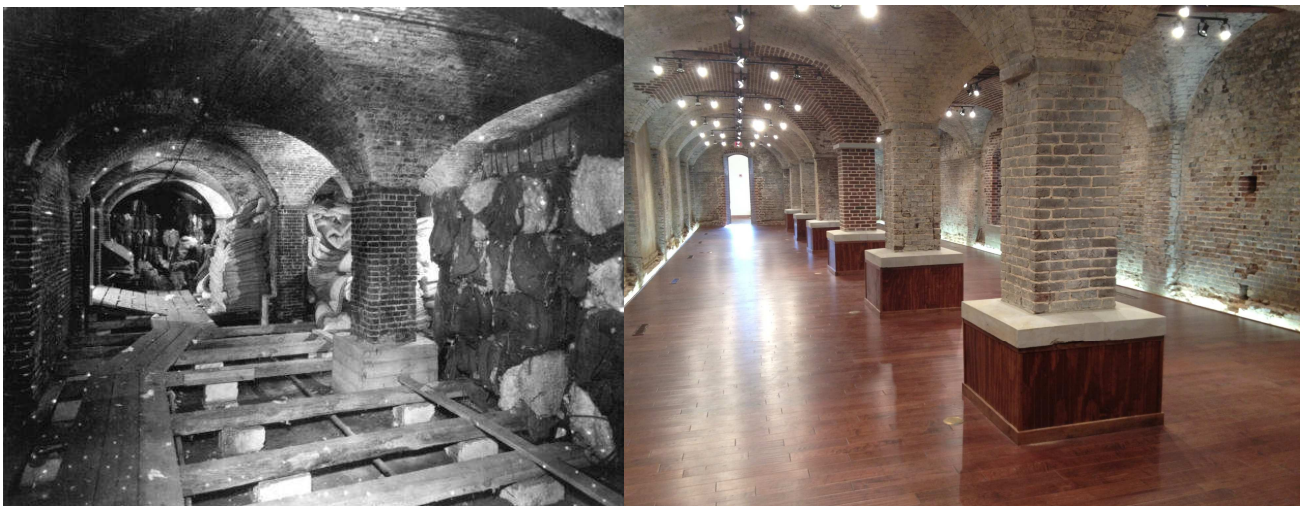
Arsenal Building at Florida State Hospital (Chattahoochee) before and after renovation