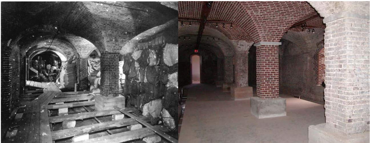
Arsenal Building at Florida State Hospital (Chattahoochee) before and after renovation