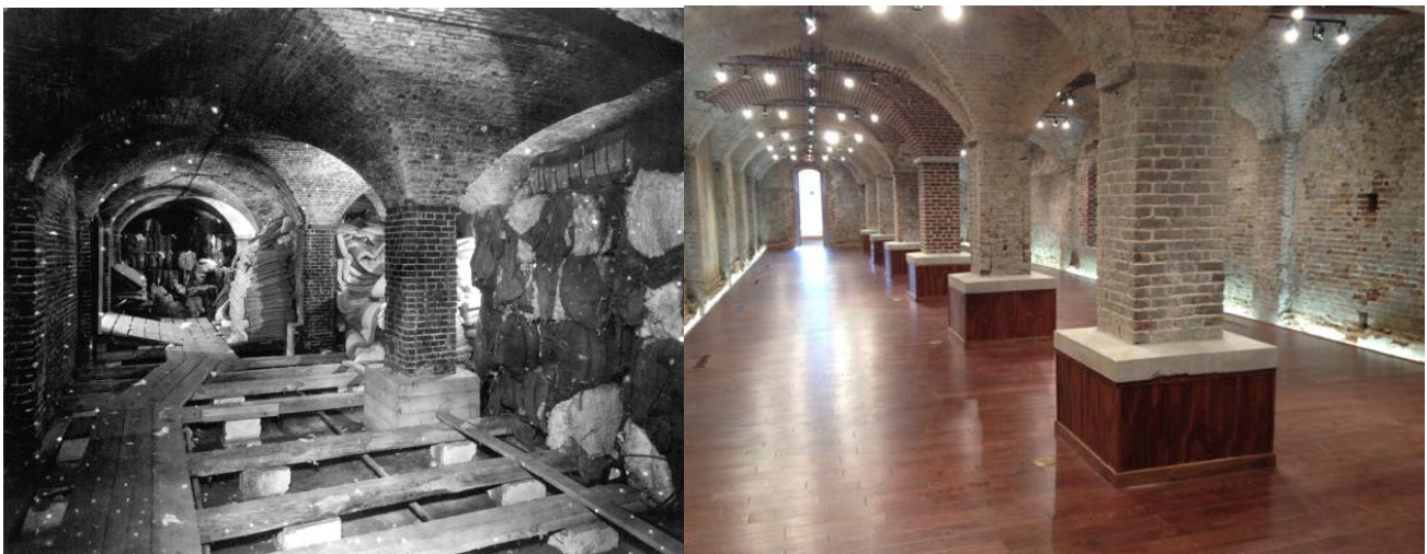
Arsenal Building at Florida State Hospital (Chattahoochee) before and after renovation